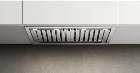
Photograph is for information purposes only. May not correspond to the selected version